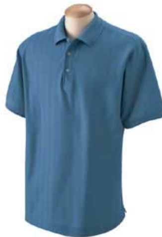
Devon & Jones Golf Shirt