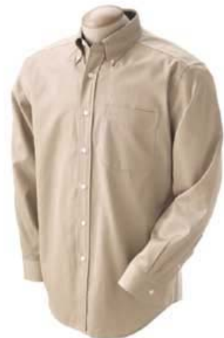
Devon & Jones Oxford Shirt

There are several ways to order your NRRPT merchandise: