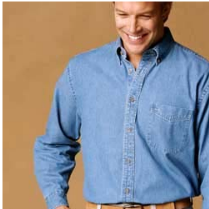
Long Sleeve Denim