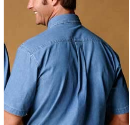
Short Sleeve Denim