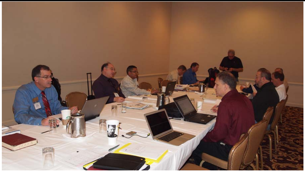
Panel Members meet in Dallas, TX

Job openings can be placed on the "Private Side" of the NRRPT website Go to www.nrrpt.org, click on Members Section then Job Openings