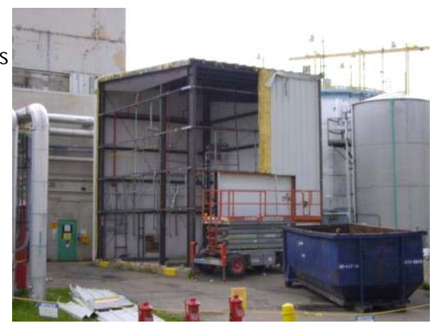
Continued on page 19