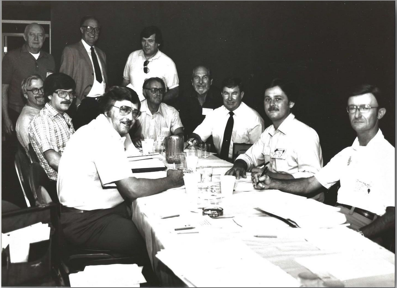
NRRPT Board Members—Then and Now