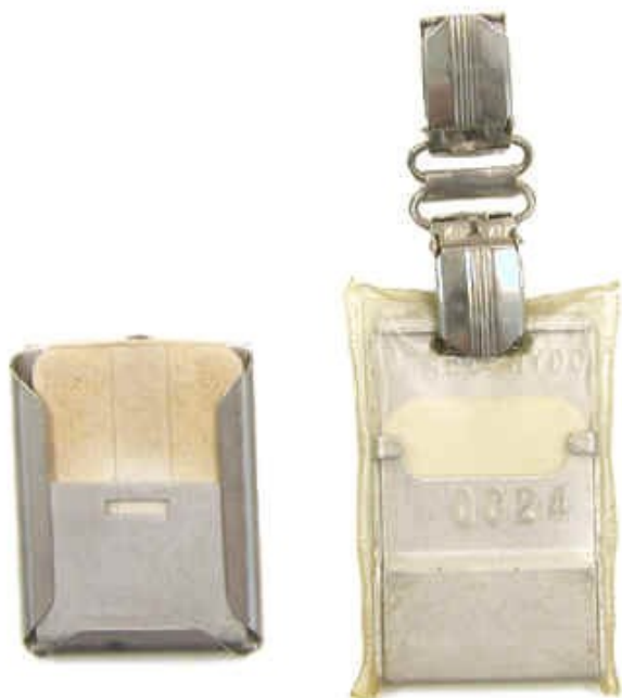
Early Dupont and AEC Film Badges (year unknown)

References: Health Physics Historical Instrumentation Collection