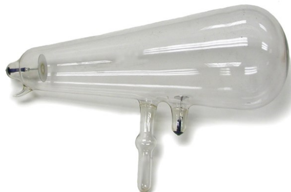
Crookes X-ray Tube