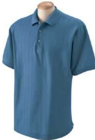
Devon & Jones Golf Shirt